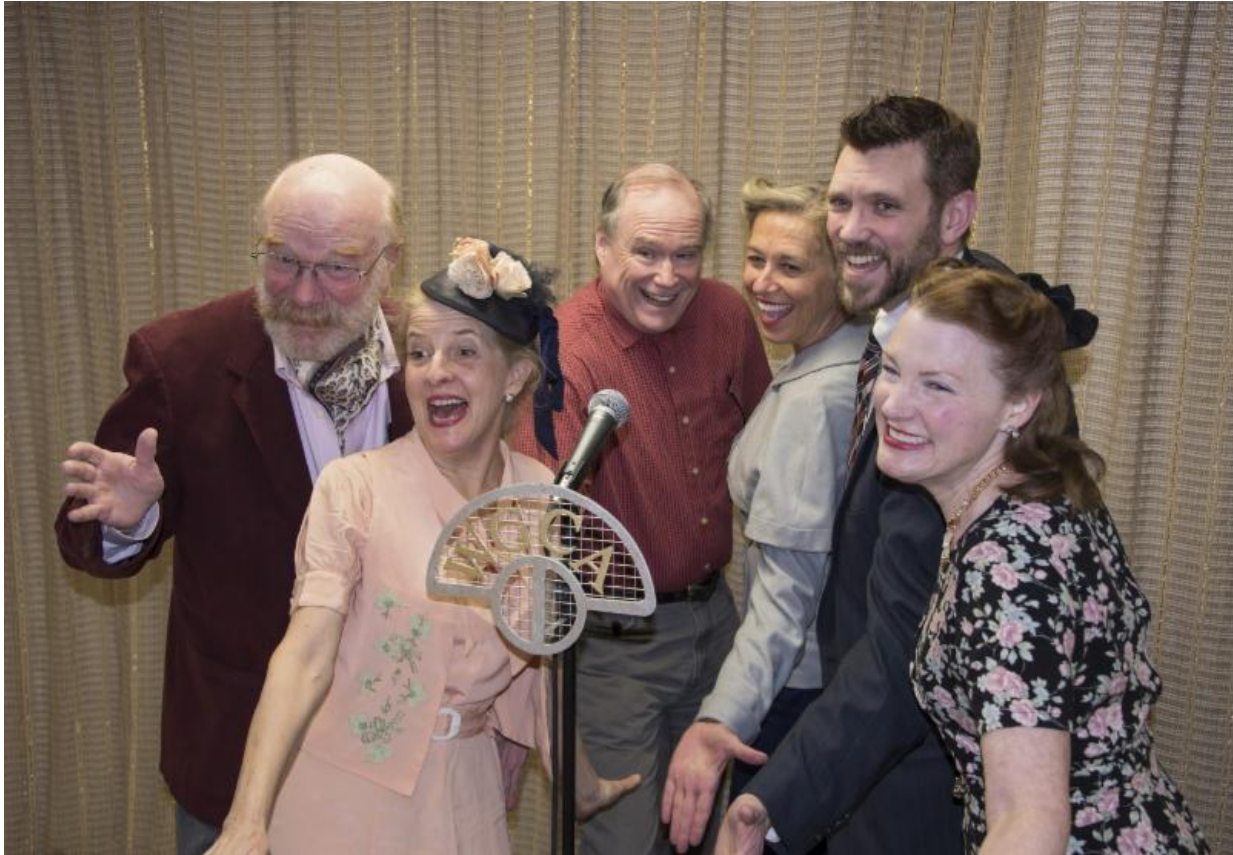
After the Thin Man