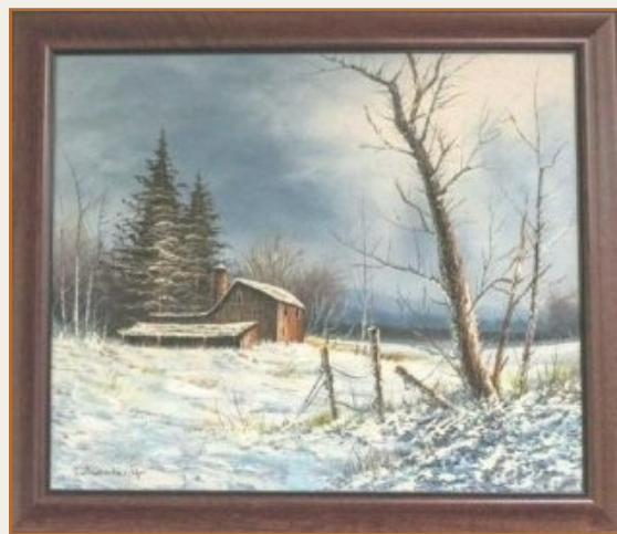
Sue Prochaska-Kiefer - Early Winter Morning