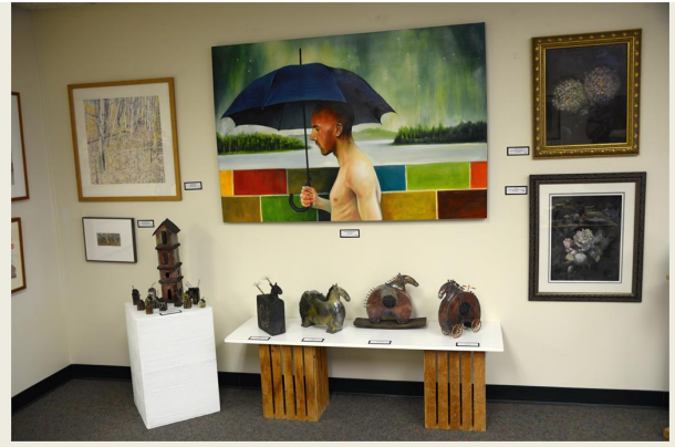
Regional Artists' Gallery