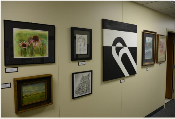
Regional Art Teachers' Exhibit