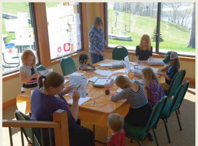
Youth Arts Festival Activities Table

April 17, in collaboration with the Galena ARC we present the Youth Arts Festival at Chestnut Mountain Resort 10 AM - 4 PM. Please support our area youth! Every child in the county is invited through their schools to be an exhibiting artist or performer in this show.