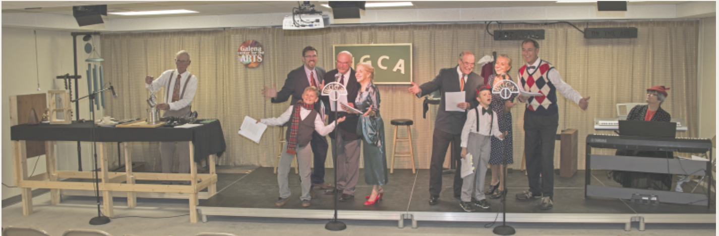
A Christmas Carol radio show cast in rehearsal

Contact us by e-mail - info@GalenaCenterfortheArts.com